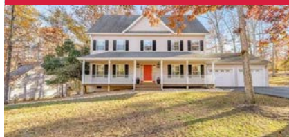
80 Pondersosa Lane Fluvanna $469,900