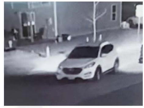
Figure 2: Photo of Stolen 2017 Hyundai Tucson