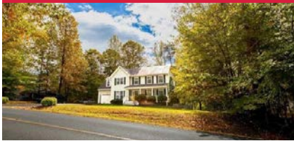
503 Jefferson Dr. Lake Monticello $364,900