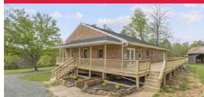
115 Montview Dr. Ruckersville $539,900