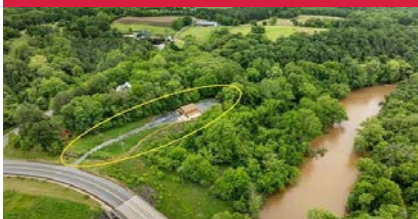
13298 James Madison Palmyra $495,000