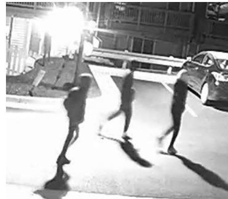
Figure 1: Photo of 3 Masked Individuals

The Fluvanna County Sheriff's Office is requesting assistance from the community regarding a series of larcenies from vehicles and a related stolen vehicle investigation in the Palmyra area.