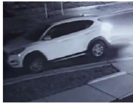
Figure 1: Side Profile of Stolen 2017 Hyundai Tucson

FLUVANNA COUNTY SHERIFF'S OFFICE PRESS RELEASE