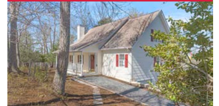
42 Cliftwood Rd. Fluvanna $749,000