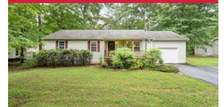
7 Riverside Dr. Lake Monticello $310,000