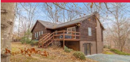
48 Jennings Dr. Lake Monticello $350,000