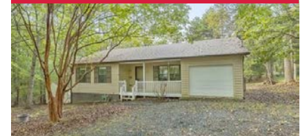
323 Jefferson Dr. Lake Monticello $273,000